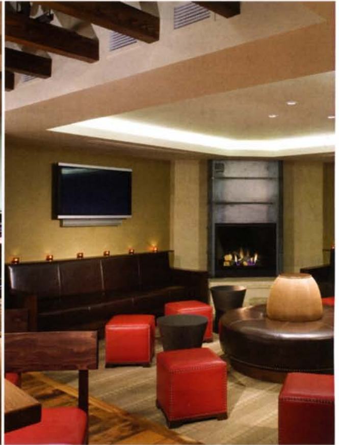
Opposite page: Ajax Tavern's main dining room. Above, from left: The bar and lounge at Sneaky's Tavern.