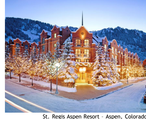
St. Regis Aspen Resort - Aspen, Colorado

R+B is currently serving as the Architect of Record (AOR) on the renovation of the St. Regis Aspen Resort. The St. Regis Aspen Resort is known to be one of the world's best and most desirable places to stay. It is ideally located at the base of Aspen Mountain and set among the heart of Aspen. The scope of the renovation includes 179 guest rooms and suites, the restaurant, lobby and all other public spaces. R+B services include construction documentation as well as being the "eyes and ears" of the renovation.