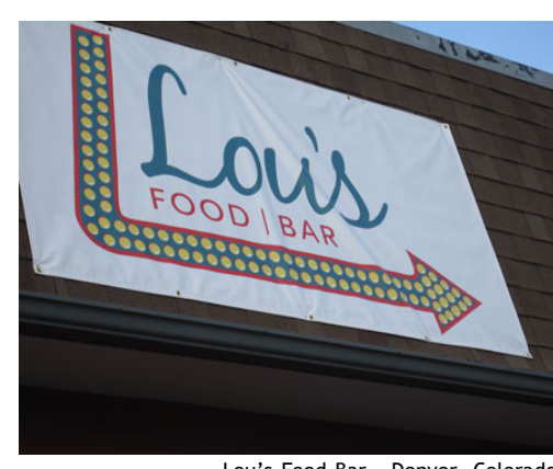
Lou's Food Bar - Denver, Colorado

Located right in the heart of North Denver's Sunnyside neighborhood is Lou's Food Bar. Formerly, Ron and Dan's Keg Lounge, Lou's Food Bar is a complete transformation from a timehonored Denver dive bar into a charming American bistro with French influences. A completely new kitchen addition was designed on the north side of the rectangular-shaped building while the south side features a new double entry with a traditional vestibule. Inside, the dining room features a combination of booths, circular banquettes and two and four top tables. The original bar has been retained and spans the length of the restaurant and seats up to 25 people. Parallel to the bar sits a charcuterie which sets the mood for the quaint, unique gastro pub. Lou's Food Bar is now open for business and is located at 1851 W. 38th Avenue. Visit www.lousfoodbar.com for more information.